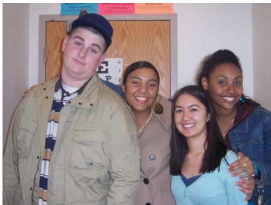
Members of Berkeley High School Health Center’s Youth Advisory Board

now gearing up for their second year on the board, and are preparing to welcome five new members, who will represent various universities and different regions of California.