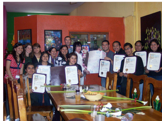
YHAB members show off certificates of commendation.

Student involvement continues today. The school’s Youth Health Action Board (YHAB) was initially created to bring together student leaders in the health center under one umbrella. The board consists of 15-20 students who assist the school’s pregnancy prevention and nutrition programs. Students are recruited at the beginning of the school year to serve on the board. Others come to the health center, see what’s happening there and want to become involved. With so many unintentional pregnancies among their friends, it’s not hard for students to recognize why it is so important to get information on this topic out to their peers. Also, as obesity rates continue to climb, students see the need for better nutrition and more physical activity all around them. Besides working on issues that are really important to the students, they also earn community service hours needed for graduation.