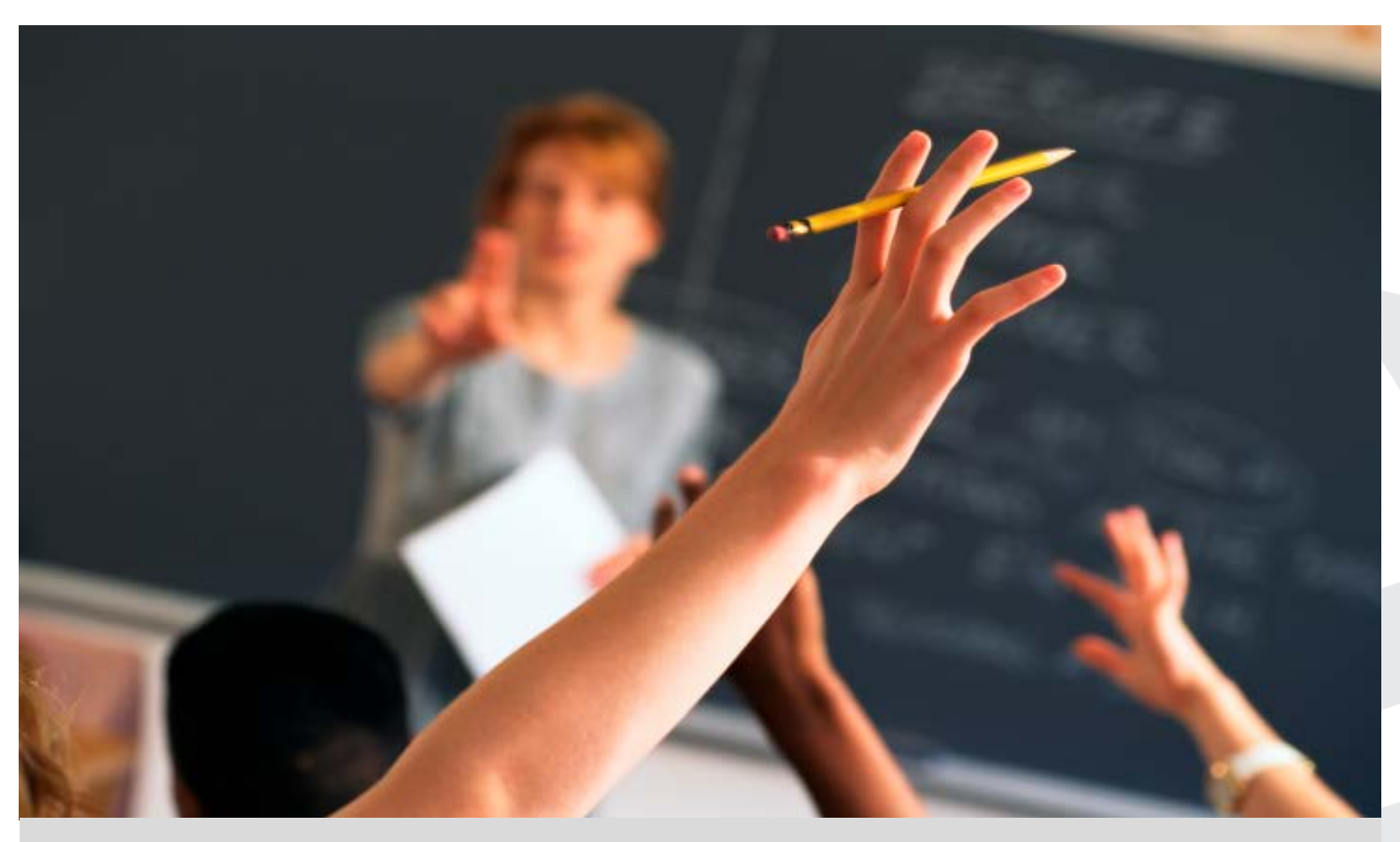
A Teacher's Best Friend