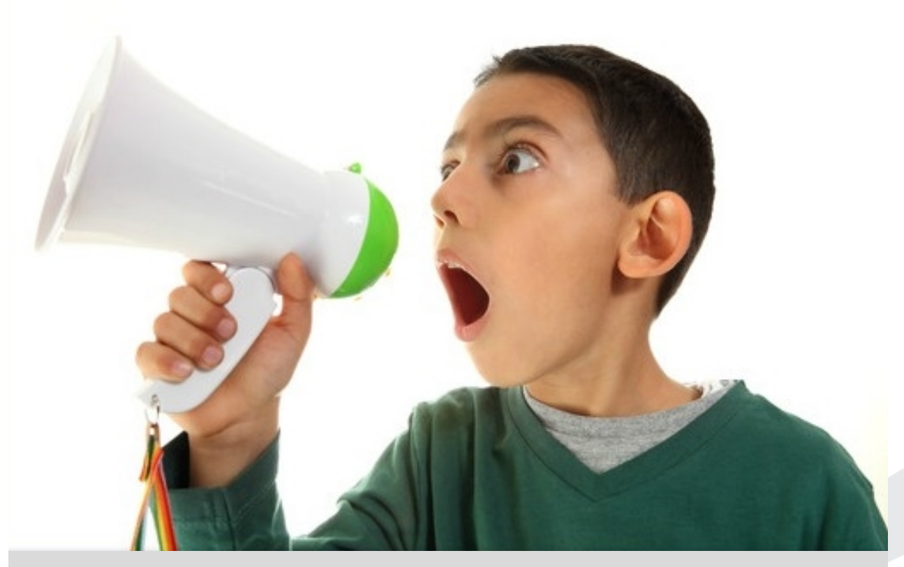
Seek Out Advocates