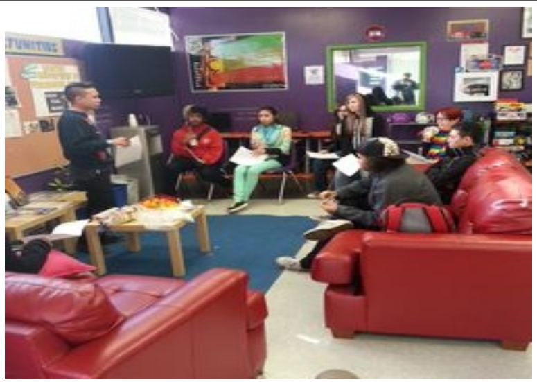
HHS students in collaboration with the RYSE Center

activities consist of anti-bullying peer education, Youth Advisory Board, mentoring, and tobacco use prevention peer education.